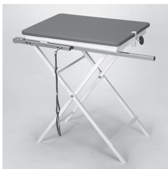
4. X-style frame will lock in place when completely upright.