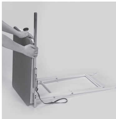
2. Lift the tabletop up to a 90° angle then slide the pull bar on the legs up to form the X-style frame.