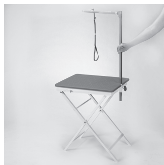
6. Place grooming arm in the slot on the edge of the table and tighten bolt clamp to secure to the tabletop.