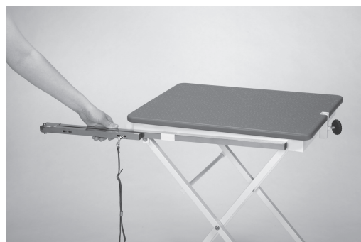
5. Slide grooming arm out of the holding slot on the side of the table.