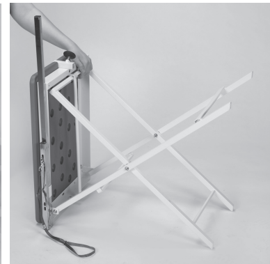
3. Hold the pull bar when rotating the table to an up upright position.